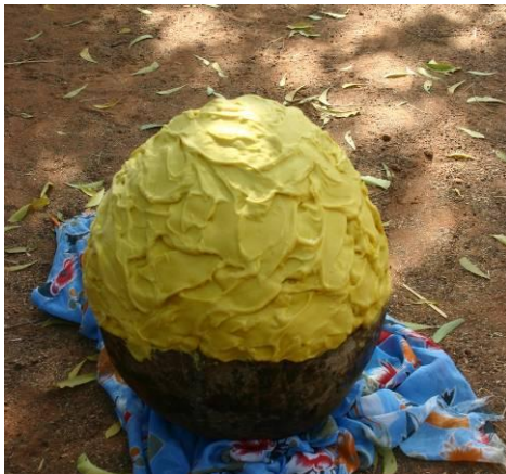
Shea butter from traditional processing.