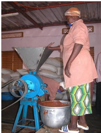
Milling.